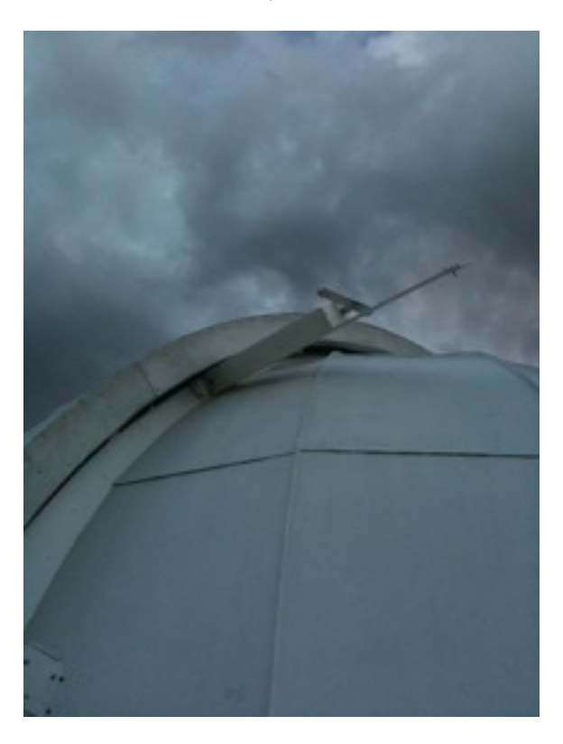
MdM Spring 2011